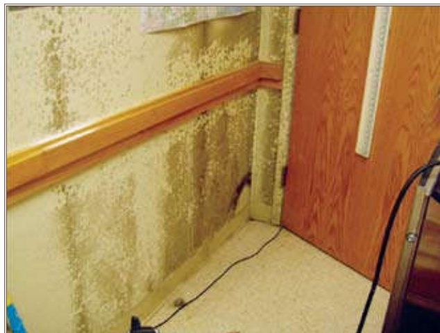
Before treatment, this barracks room wall is covered with mold.